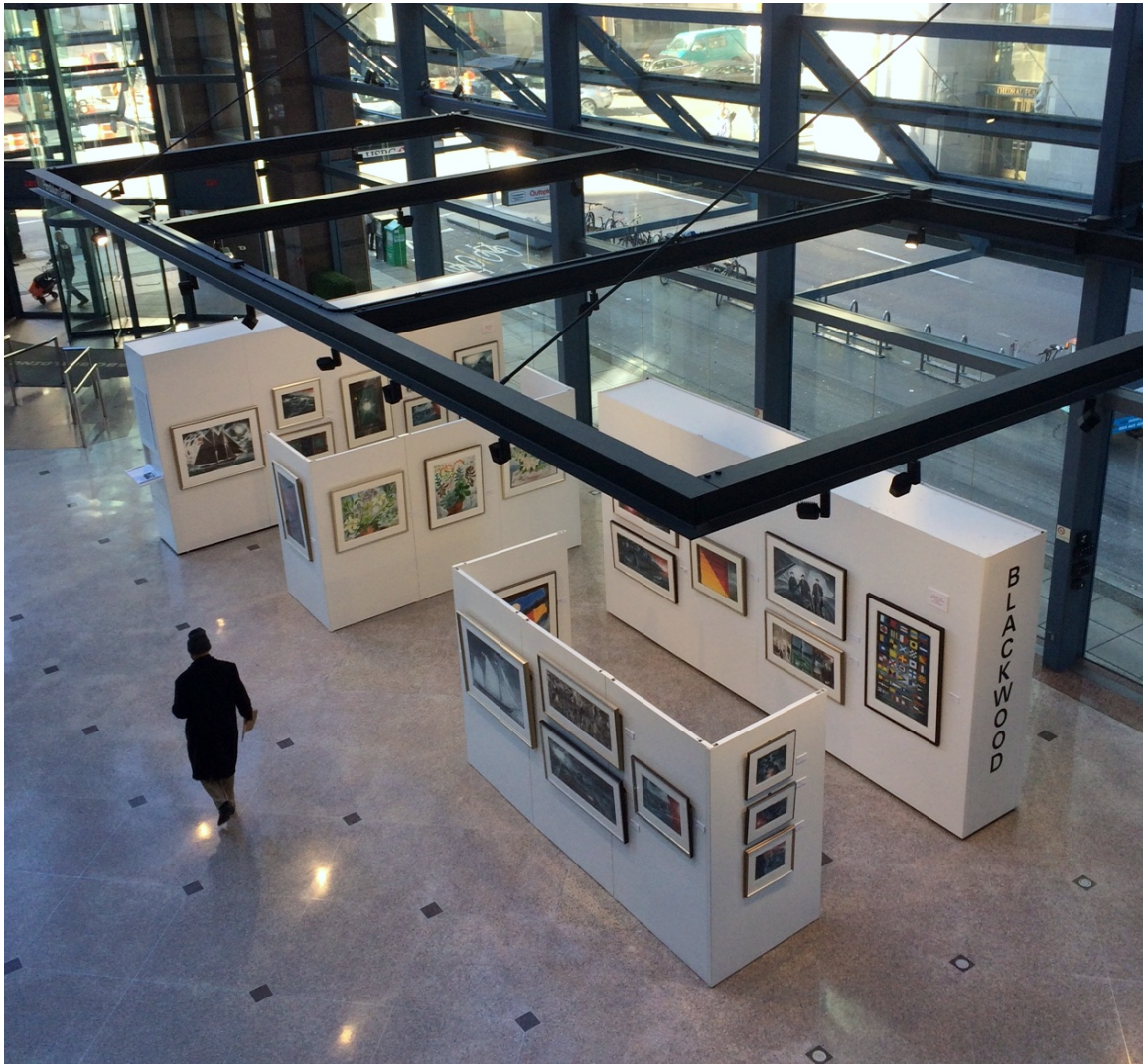
Pendulum Gallery : David Blackwood Exhibition – Jan 2017

The exhibition fee covers the cost of rental of the gallery and facilities (see below) as well as management and administration of the exhibition itself. We coordinate media contacts and listings as well as promotion of exhibition on social media (Facebook and Instagram). We also provide curatorial input for planning exhibition leading up to show and professional layout and hanging of the artworks at installation.