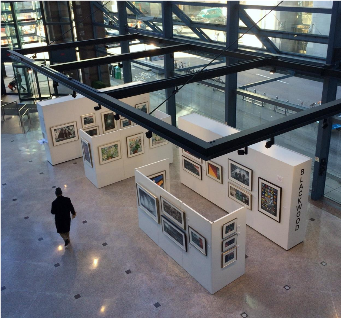
Pendulum Gallery : David Blackwood Exhibition – Jan 2017